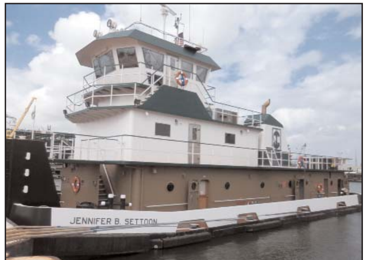
M/V Jennifer B. Settoon