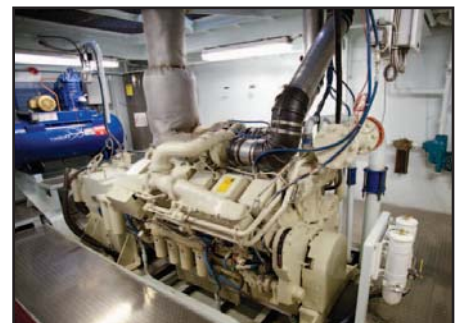
Cummins K25-M Diesel

The mv. Cindy T. Settoon is the 54th vessel in Settoon's inland towboat fleet. It is the fourth of class and the sister ship to the Ryan L. Settoon, Scott A.