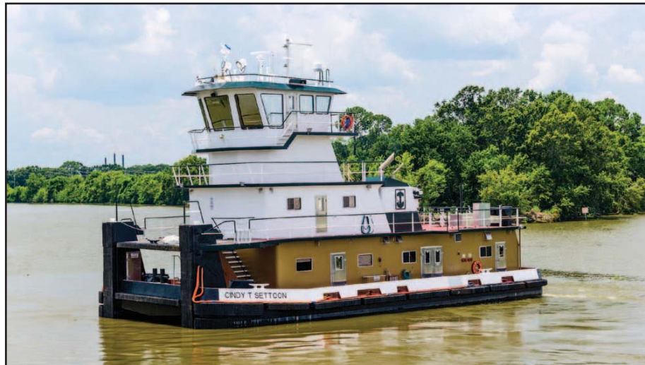
The Cindy T. Settoon is the 54th vessel in Settoon's inland towboat fleet.